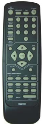
Infrared Remote Control with discreet codes