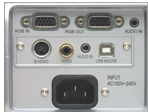
The ImagePro 8039A inputs are easily accessible.

At 7.2 lbs and being a small size, it's easy to transport with the included soft carry case. This value packed projector has a SVGA resolution with advanced electronics that permit showing XGA or VGA images. An IR remote control permits operation from convenient locations and can turn the projector completely "On" or "Off".