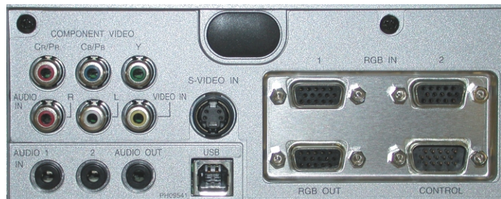
The ImagePro 8801A inputs are easily accessible.

We have taken the majority of features found in our best selling XGA projector and put it into a 7 lb. package. So you now have a dynamo projector that is 7 lb. lighter. The new features on the ImagePro™ 8801A include Component Video and HDTV compatibility. This projector is perfect on the road or in the ceiling. It also has a much quieter operation with whisper mode setting, plus a 400-1 contrast, and a Kensington slot for secure installation. A custom start-up screen and digital horizontal & vertical keystone correction complete the features.