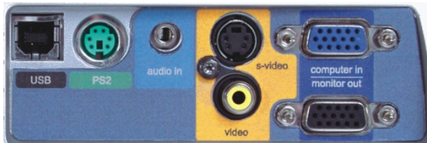
The ImagePro8753 inputs are easily accessible. Connecting your computer is quick and easy.

The Dukane ImagePro 8753A™ is a full-featured multimedia projector, which employs the latest LCD technology to produce vibrant saturated color images. Using XGA native resolution of 1024 x 768 pixels it will display virtually any computer or video image. With a light output of 1300 ANSI lumens and a contrast of 400:1, the image is clearly visible in classrooms and offices. This projector is an exceptional value while still providing easy operation in schools and business locations. It has simple controls, is ultra quiet, can be ceiling or table mounted, has digital keystone correction, operates with automatic image