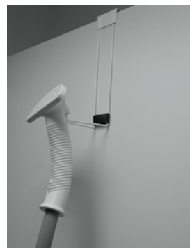
Hanging the t-nozzle on the door hook

Remove the hose cap. Fill the reservoir with clean tap water to the desired level or until water reaches "Max Fill" line on side of unit. DO NOT OVERFILL as this will cause water to boil out of steamer and spill. Empty until water is just under the overflow indicator. DO NOT FILL THE CONTAINER WITH HOT WATER.