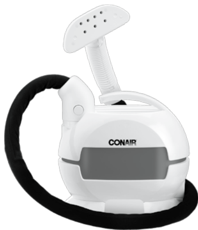
Ready for storage