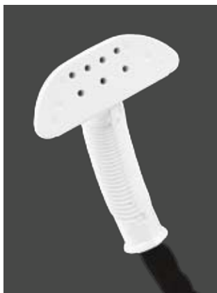
high-velocity steam jet T-nozzle

CAUTION: Hose will be hot when in use. Avoid prolonged contact.