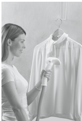
Using the over-the-door hook

Wash and dry drapes as directed according to fabric type. Re-hang drapes and steam drapes when in place.