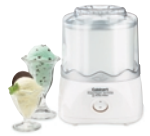
Ice Cream Makers

Discover the complete line of Cuisinart® brand premier kitchen appliances including food processors, mini food processors, hand mixers, blenders, toasters, coffeemakers, cookware, ice cream makers and toaster ovens at