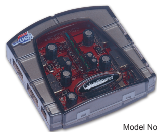
Model No. CP-H420P

Quick Start Guide for USB 2.0 4 Port Hub