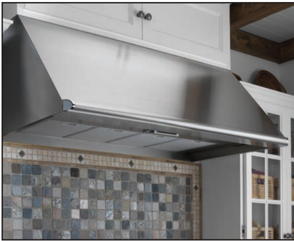
Epicure® 48" x 12"