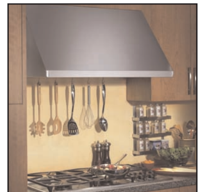
Millenia® 36" x 18" (different views)