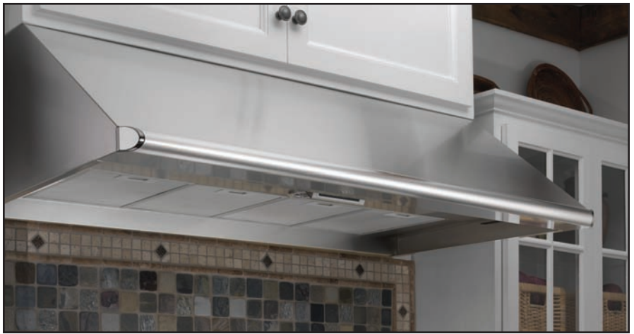
Epicure® 48" x 12" with New Anodized Filter Construction