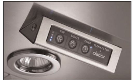
Electronic Touch Controls

Millennia® Models - Stainless Steel Only (S)