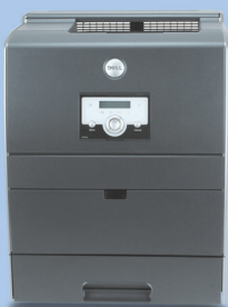
Dell Laser Printer 3100cn

The Dell Laser Printer 3000cn and the 3100cn are networked colour-capable laser printers priced competitively with similar-speed monochrome-only products. Designed for small workgroups, both printers offer fast printing speeds of up to 25 A4 pages per minute in monochrome and 5 A4 pages per minute in colour. Both printers come with built-in Ethernet networking and a robust 45 000 page monthly duty cycle to meet workgroup print requirements. The 3100cn offers additional paper input capacity, extra font capability and higher-capacity toners for maximum print economy. Both printers are quickly and easily expandable with the optional duplex unit (to enable printing on both sides of the paper), additional input capacity for a maximum of 900 sheets and upgradeable memory up to 576 MB. Running costs are low with competitive cost per page in both monochrome and colour print modes.