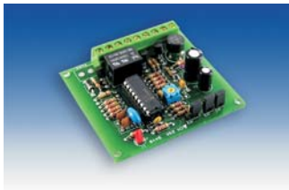
ABD-110 Timer Board

The ABD-110 timer allows for timed or latched functions of the relay. In timer mode, the unit can in a x1 mode, (the timer is set between 1 and 60 seconds.) Or a x10 mode (the timer is set between 10 and 600 seconds.) In latch mode, the timer does not apply, and the relay will remain energized unit a short is applied between the reset terminals.