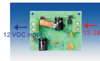
SM1228 Power Transformer Module

SM1228 Power Transformer Modules an easy applicable control module for 13-28VDC ranging input auto convert to 12VDC voltage output great deal of real profitable.