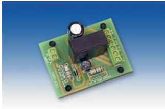
DBR-200 Relay Board

The DBR-200 Relay module is worked when power input then contacts will change over from N/C (Normally Close) to N/O (Normally Open)