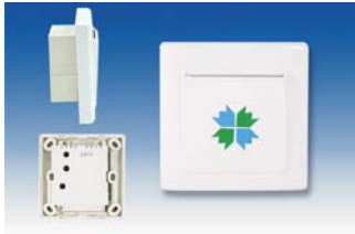
GH-803-110J-BG Power Consumption Switch

Direct use of card (ISO Card Specification) can be installed in the rooms main electrical switch, a 20 sec. Gap after card take out, ensures that the customer room is safe.