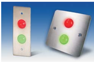
Door Status Indicator