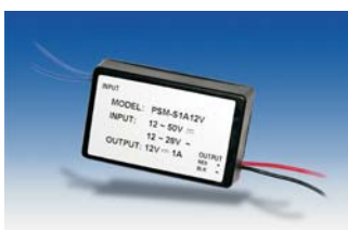
PSM-S1A12V Waterproof Switching Module