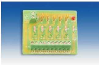
GPD-3015 Voltage Distribution Board

The ABD-110 timer allows for timed or latched functions of the relay. In timer mode, the unit can in a x1 mode, (the timer is set between 1 and 60 seconds.) Or a x10 mode (the timer is set between 10 and 600 seconds.) In latch mode, the timer does not apply, and the relay will remain energized unit a short is applied between the reset terminals.