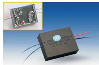
SM1224-1A Power Transformer Module