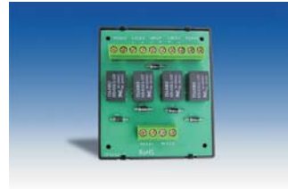
ILM-200 Interlock Module