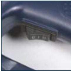
Position 2: 50° - 650°C