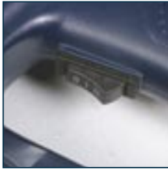
Position 0: Stop/Off

The rocker switch can be adjusted to 3 positions and these are: