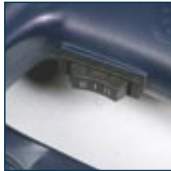
Position 1: 50° - 550°C