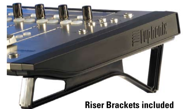
Riser Brackets included to increase height and viewing angle