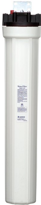
A-20 20" Opaque Housing: EV9100-03