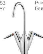
Helia™ Contemporary Series Faucet Polished Stainless EV9008-20 Brushed Stainless EV9008-21