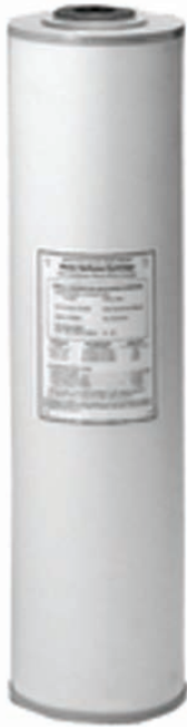
SO-10 Softening Cartridge: DEV9105-41