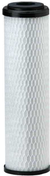
CG5-10 Replacement Cartridge: DEV9108-15