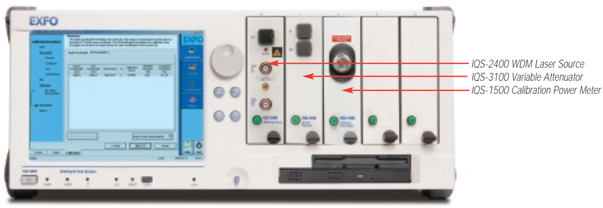
A typical power-measurement setup.

This procedure yields a detailed calibration report (in HTML format), with total calibration uncertainty for each calibrated wavelength. Data can be saved on a floppy disk, the system's hard drive or a remote controller station, making storage space practically limitless. Thanks to Windows-based software, the IQS-1500 can work with any compatible system.