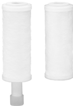
SWS-10 Sediment Filter Wrap: EV9799-05

Adds sediment filtration capabilities to Wrap ScaleStick®, which provides scale and corrosion control