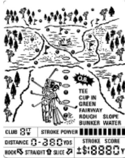
Golfer's View (on right of unit)