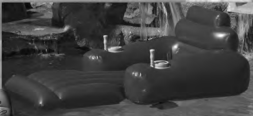
Model No. PR10