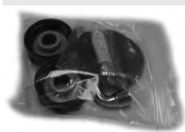
Figure 2: Nuts, Bolts, Washers O-Rings and Restoration Kit