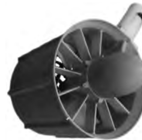
Figure 8: Motor Subassembly that Encloses the Propeller