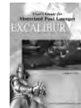
Figure 11: User's Guide