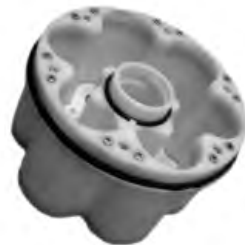
Figure 3: Battery Compartment