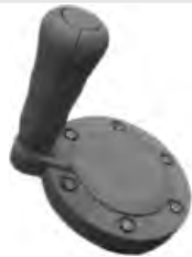
Figure 4: Battery Cover & Handle