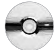
Figure 12: Instructional DVD