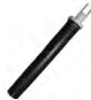
Figure 6 Control Arm