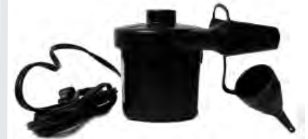
Figure 9: Electric Air Pump with Nozzle Attachments