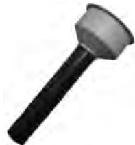
Figure 5: Control Arm Sleeve