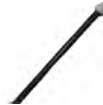
Figure 7: Electrical Connection Shaft