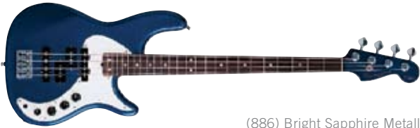
(886) Bright Sapphire Metallic