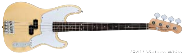
(341) Vintage White