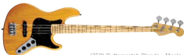
(750) Butterscotch Blonde - Maple