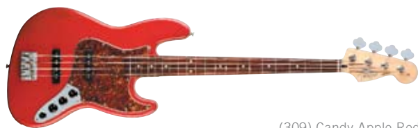
(309) Candy Apple Red