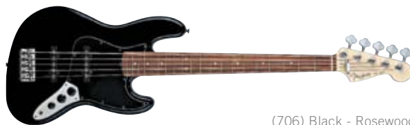
(706) Black - Rosewood