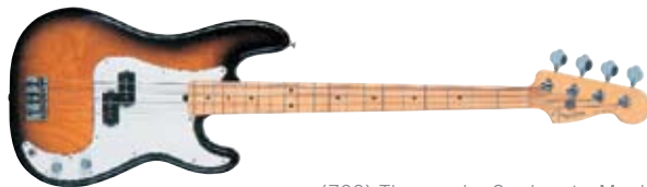
(700) Three-color Sunburst - Maple