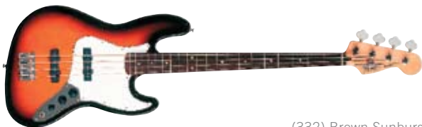
(332) Brown Sunburst