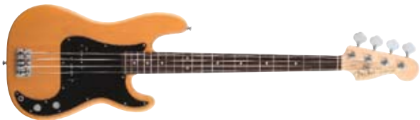
(750) Butterscotch Blonde - Rosewood