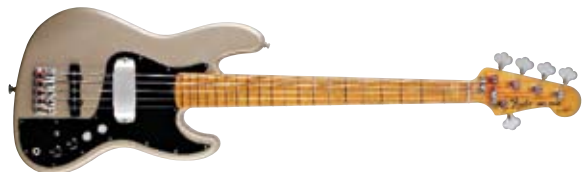
(844) Shoreline Gold