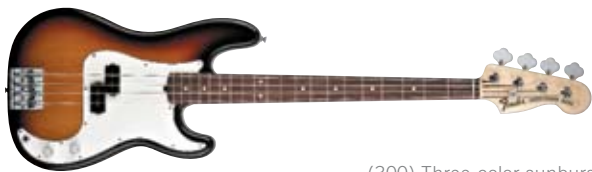
(300) Three-color sunburst