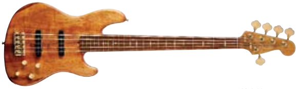
Fretted - (821) Koa Top

This beautifully crafted, exotic-wood Jazz Bass guitar has a sleek body comprising a koa top over rosewood and mahogany paired with a maple neck and rosewood fingerboard. Special Design Noiseless™ pickups add warmth and lows that complement the hardwood body's natural clarity and brightness, resulting in an extremely dynamic tonal range. The 18-volt circuitry has been tweaked at the input stage (pre-shape, boost and EQ settings) to enhance the unique sonic nature of the exotic woods.