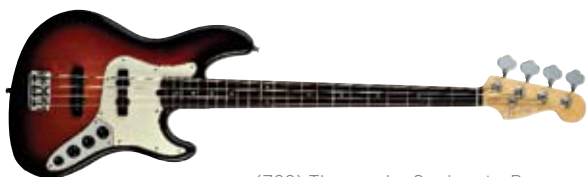
(700) Three-color Sunburst - Rosewood