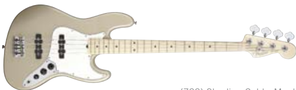
(722) Shoreline Gold - Maple