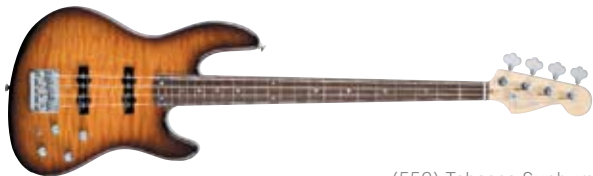
(552) Tobacco Sunburst