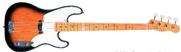
(303) Two-color Sunburst

From his years in The Police to his prolific solo career, Sting has always brought the bass out front in pop music. This '50s Precision Bass guitar features a contoured, Two-color Sunburst ash body with a thick one-piece "C"-shaped maple neck and 20-fret fingerboard. Other features include a vintage single-coil pickup that delivers that classic tone, Sting's signature in the block pearl inlay at the 12th fret, a vintage two-saddle bridge, reverse tuning machines and a single-ply white pickguard. Deluxe gig bag included. Available in Two-color Sunburst (303).