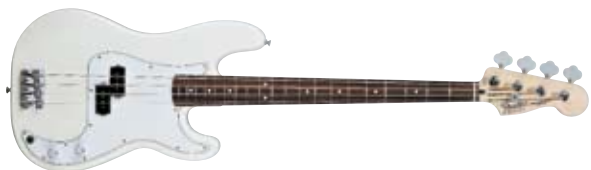
(380) Arctic White