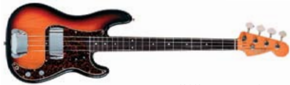
(800) Three-color Sunburst