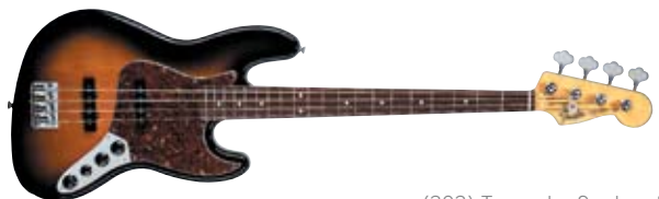
(303) Two-color Sunburst

With more tonal variations than ever before, the Power Jazz Bass guitar is all about providing more power at your fingertips. It all starts with the pickups—the Power Jazz Bass features two standard Jazz Bass single-coil pickups coupled with a four-saddle piezo Fishman® Power Bridge (for acoustic/electric tones) and independent volume controls for precise pickup blending. Other features include an alder body, modern "C"-shaped maple neck with rosewood fingerboard, vintage-style Jazz Bass control knobs and chrome hardware. Available in Two-color Sunburst (303).