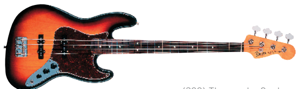
(300) Three-color Sunburst