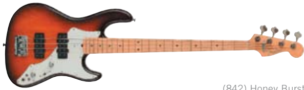
(842) Honey Burst

The Roscoe Beck bass provides a very cool blend of vintage vibe and modern flexibility. Passive electronics are combined with humbucking pickups, a three-position blade pickup selector switch and mini toggle switches to provide myriad great tones without a battery. Chrome hardware includes Hipshot® Ultralite™ tuners including a Drop-D tuner on the E string. Select alder body, maple neck and a choice of rosewood or maple fingerboard. Available in Three-color Sunburst (800), Lake Placid Blue (802), Crimson Red Transparent (838) and Honey Burst (842).