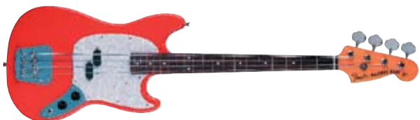
(540) Fiesta Red