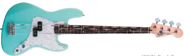
(357) Surf Green