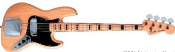
(821) Natural - Maple

A bound fingerboard, three-knob controls (volume neck, volume bridge and master tone) and block inlays are standout features of this classic model, the American Vintage '75 Jazz Bass guitar, which is available with either a maple fingerboard with black binding, black block inlays and three-ply black pickguard; or a rosewood fingerboard with white binding, Pearlloid block inlays and a three-ply white pickguard. Other features include two '75 vintage-style Jazz Bass single-coil pickups, "bullet" truss rod and our proprietary three-bolt Micro-Tilt™ neck adjustment feature. Available in Natural with maple fingerboard (black pickguard) or rosewood (white pickguard) and a period-correct polyurethane finish.