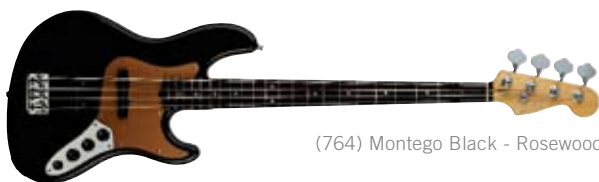
(764) Montego Black - Rosewood