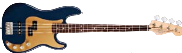
(359) Navy Blue Metallic