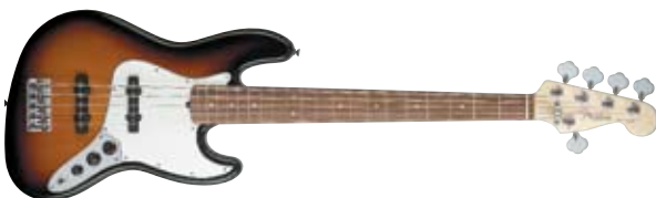
(700) Three-color Sunburst - Rosewood