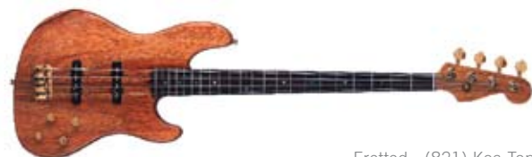
Fretted - (821) Koa Top

This beautifully crafted, exotic-wood Jazz Bass guitar has a sleek body comprising a koa top over rosewood and mahogany paired with a maple neck and rosewood fingerboard. Special Design Noiseless™ pickups add warmth and lows that complement the hardwood body's natural clarity and brightness, resulting in an extremely dynamic tonal range. The 18-volt circuitry has been tweaked at the input stage (pre-shape, boost and EQ settings) to enhance the unique sonic nature of the exotic woods.