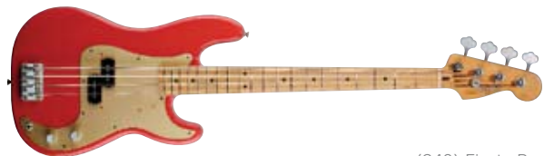
(340) Fiesta Red