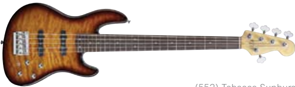
(552) Tobacco Sunburst

Five-star five string! The gorgeous Jazz Bass 24 V is an upgraded five-string version of our wildly popular Jazz Bass 24 guitar, with the eye-popping quilted maple top, abalone dot inlays, high-mass bridge and Seymour Duncan® Basslines™ pickups with a switchable onboard passive/active circuit for added versatility. Available in Tobacco Sunburst (552).