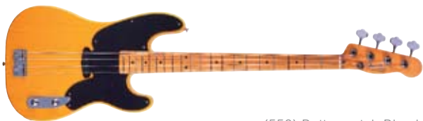
(550) Butterscotch Blonde