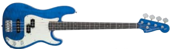
(570) Blue Transparent