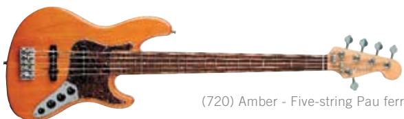
(720) Amber - Five-string Pau ferro