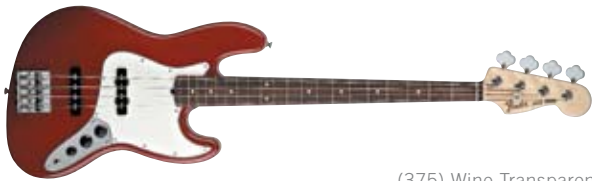
(375) Wine Transparent