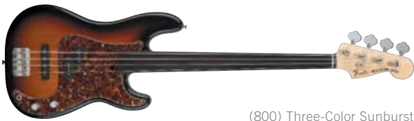
(800) Three-Color Sunburst