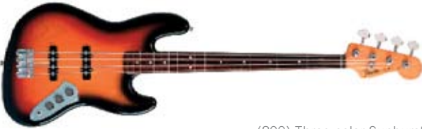
(800) Three-color Sunburst

Jaco Pastorius was a beacon for generations of aspiring bass players, bridging the gaps between R&B, rock, jazz, classical and Caribbean music. He changed the musical world with his visionary approach to the instrument, and he did it with one fundamental tool—a Fender Jazz Bass guitar. Although he played a fretted and a fretless Jazz Bass guitar, Jaco's unique voice and signature sound centered on his Three-color Sunburst fretless. Features include an alder body, pau ferro fingerboard, brown hard-shell case, strap and cable.