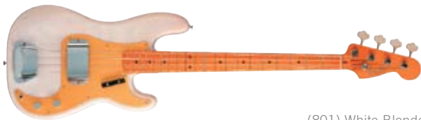
(801) White Blonde