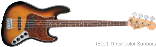
(300) Three-color Sunburst