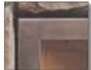
Hand-Rubbed Antique Nickel Trim