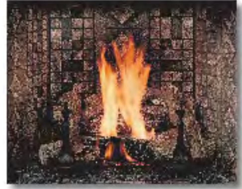
Diamond Mosaic Tile