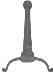
Wrought Iron Andiron