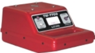
The TW-7700 Transmitter.

WARNING: Do not handle output leads unless power is off. ELECTRIC SHOCK HAZARD: Servicing to be performed by qualified personnel only.