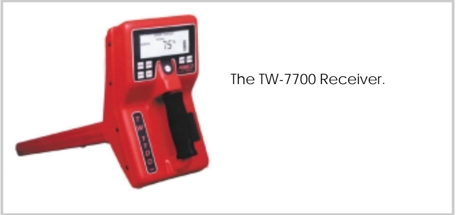
The TW-7700 Receiver.