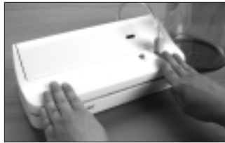
Press and Release Lid