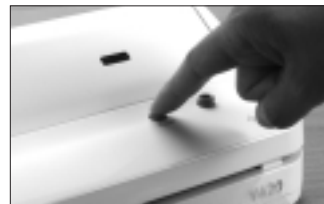
Press Open/Cancel Button