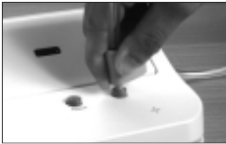
Insert Accessory Hose