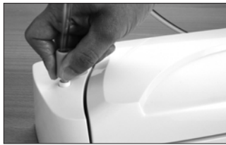
Insert Accessory Hose