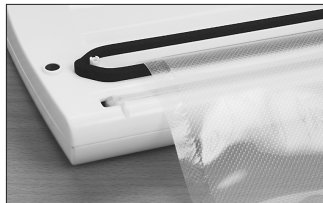
Place Bag in Vacuum Channel