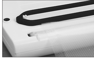
Place Bag on Sealing Strip