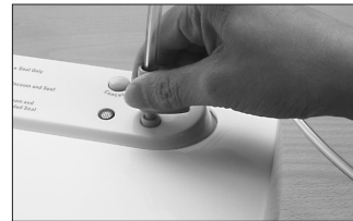
Insert Accessory Hose