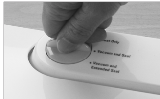
Set Seal Control Switch