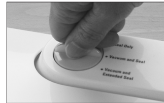
Set Seal Control Switch