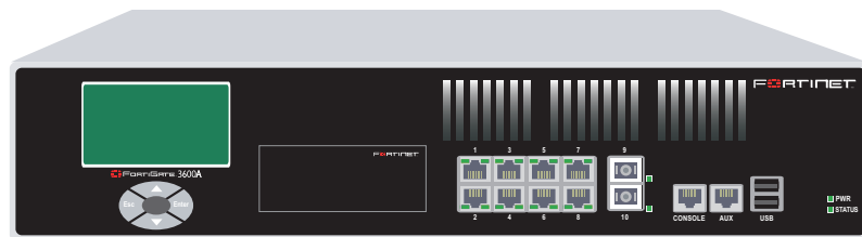
Figure 1: FortiGate-3600A