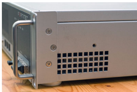
Figure 1: Installed mounting brackets

The following photos illustrate how the brackets should be mounted. Note that the screw configuration may vary depending on your FortiGate unit.