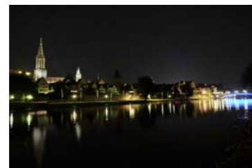
Low noise and high sensitivity. ISO 3200