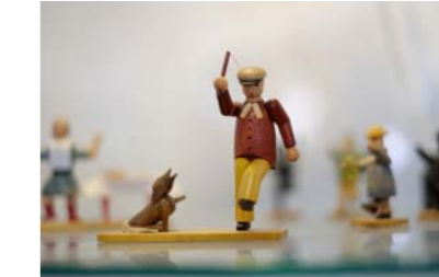
F1.4 Shallow depth of field for a beautiful "bokeh" effect