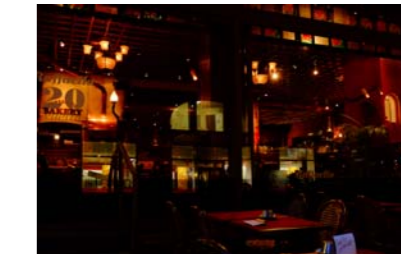
-2 of exposure reduction. Deepen shadows and dark areas.