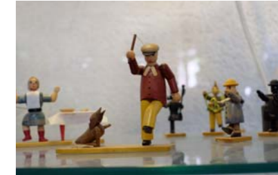
F8.0 Deep focus to capture even distant background in vivid detail