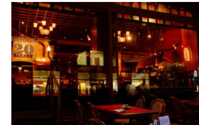
+1/3 steps of increased exposure. Brighten the subject.

Multiply your enjoyment of every shot with FUJIFILM X-A1 accessories.