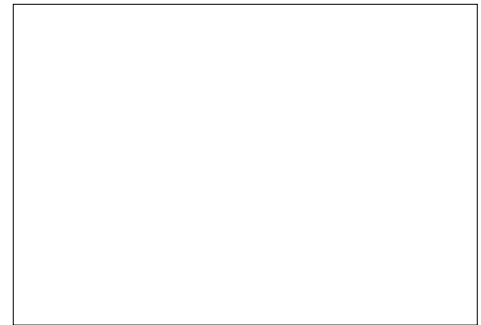
FTP-621MCL301/302 shown after assembly with FTP-621CT001cutter