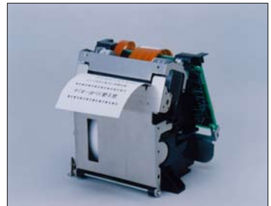
FTP-627USL401 platen closed