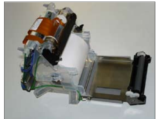
FTP-627USL401 platen open