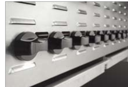
High-Low controls for each section for the perfect set-up

Convenient High low valves allow you to configure your broiler perfectly for your menu. Once set, no adjustment is necessary. Simply use the Quick Switch to start the unit. Training is kept to a minimum.