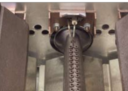
Continuous sparking ignition keeps the flame alive

There are no pilot lights in the new Garland HE Broiler. Instead, an electronic sparking mechanism is used to fire up the burners. Should gas flow be interrupted or the flame extinguish for any reason, the spark sequence automatically attempts to re-fire the broiler allowing for trouble free, continuous operation.