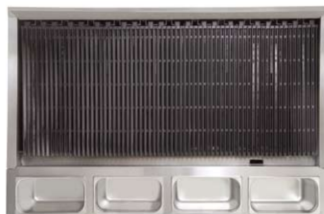
Up to 130° temperature variation across the entire surface