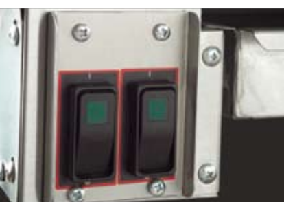
A simple flip of the Quick-Switch is all it takes to fire the unit up

Garland has made the HE Broiler so easy to use that starting or stopping the broiler is as easy as flipping a switch. The switch automatically starts the sparking sequence and opens the gas valve allowing the unit to fire up almost instantly. Further, the broiler is divided into zones (each with individual controls) to provide flexibility and assist in energy savings.