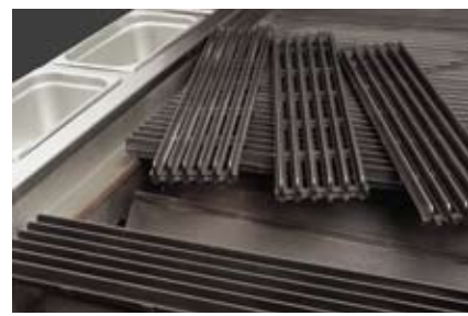
Easy to handle cast iron grates remove in sections

The robust grill and radiant plates are made from durable cast iron. Beneath the burners, stainless steel deflectors help with heat efficiency and reduce flare up. Solid stainless steel exterior and commercial grade components throughout ensure a robust, durable product built to last.