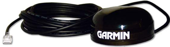
FIGURE 1. Garmin 16-HVS GPS Receiver, Part Number 17215