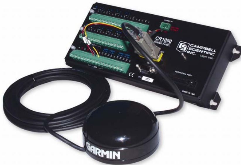
FIGURE 3. CR1000 to GPS16-HVS Using the 17218 Adapter