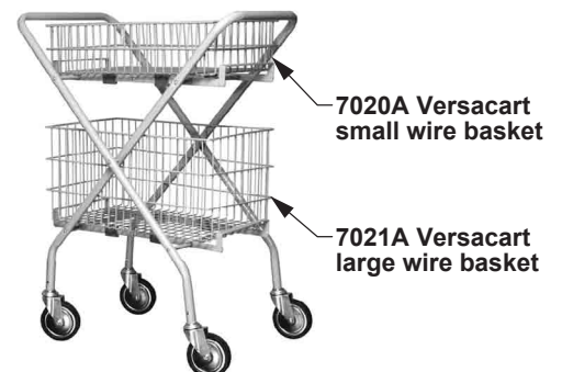
7010A Versacart assembled