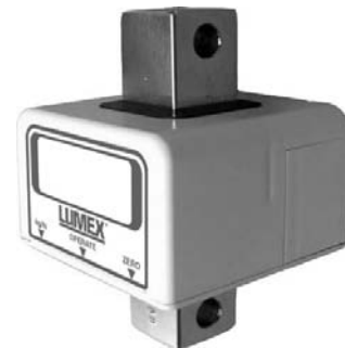
patient lift scale

The LUMEX Lift Scale is a compact precision scale system designed for use with approved lift designs employing compatible boom and hanger configurations.