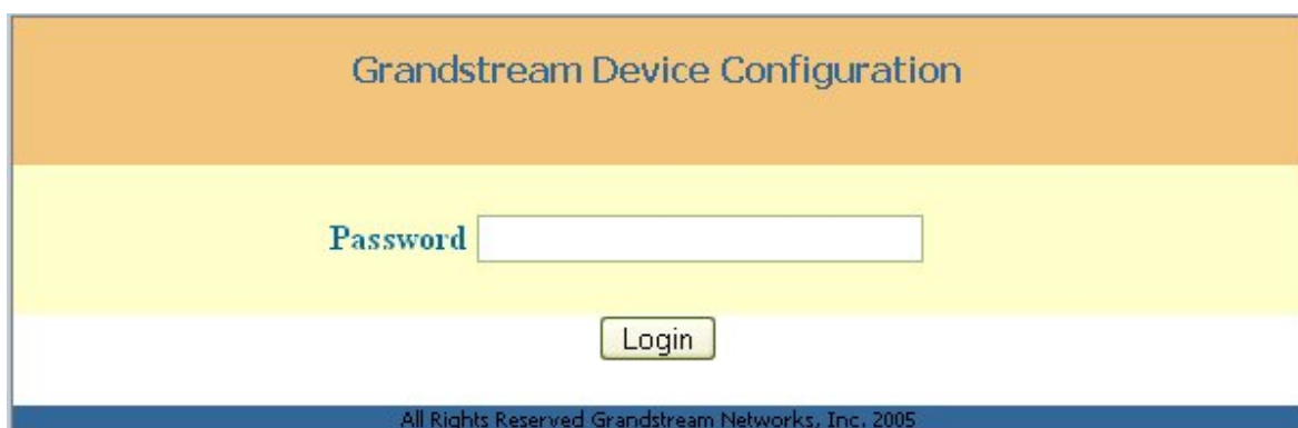
FIGURE 4: SCREENSHOT OF ADVANCED USER CONFIGURATION LOG-IN PAGE

Each FXS SIP account has its own configuration page. Their configurations are identical.