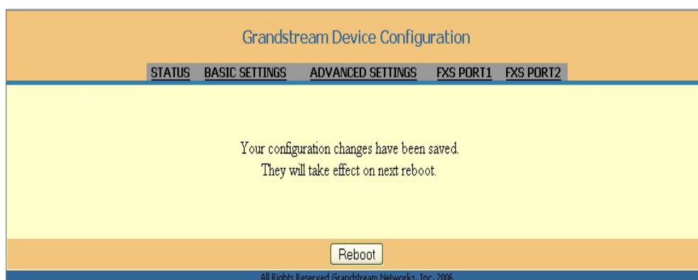
FIGURE 5: SCREENSHOT OF SAVE CONFIGURATION PAGE

After making a change, click the “Update” button in the Configuration page. The HT-496 will display the following screen to confirming changes. Reboot or power cycle the HT-496 to enable the changes.