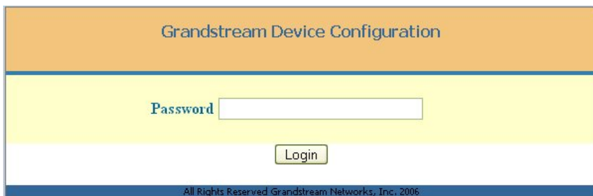
FIGURE 3: SCREENSHOT OF CONFIGURATION LOG- IN PAGE

NOTE: If you cannot log into the configuration page by using default password, please check with the VoIP service provider. The service provider may have provisioned and configured the device for you. The Basic Configuration Page is the first web GUI the user will see.