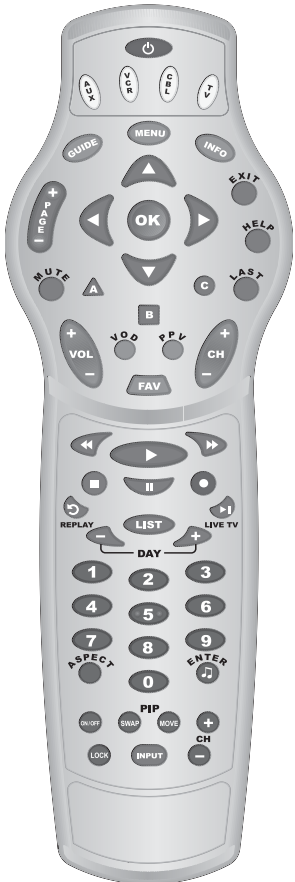
© 2004 ICX Global, Inc. All rights reserved. Part Number ICX18346, version 1.0 07012004

VISIT US ON THE WEB YOU CAN FIND PROGRAMMING INSTRUCTIONS AND CODES FOR ALL OF OUR REMOTE CONTROLS, AS WELL AS INFORMATION ABOUT OUR OTHER PRODUCTS ON OUR WEBSITE: www.icxglobal.com