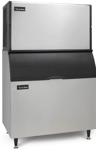
ICE1806 on B100