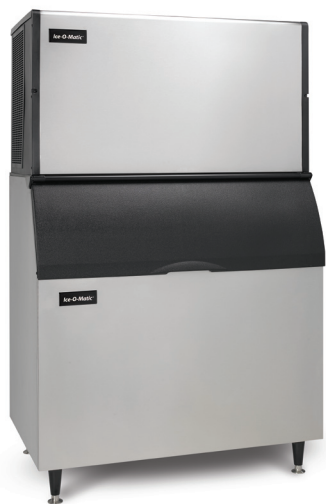
ICE1806 on B100