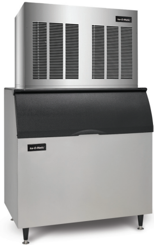
MFI2406 on B100