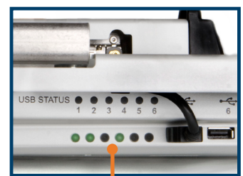
6 LED's for USB Status