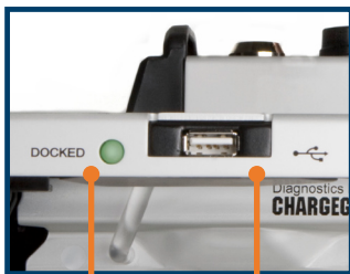
LED Dock Diagnostics

Single or Dual Hi-Gain Antenna Speaker/Mic VGA Integrated Cable Strain Relief Clips