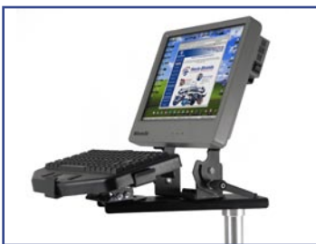
Perfect for mounting laptops or 2 & 3-piece modular computer workstations.