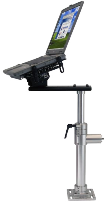
C-PED1612-W4 model shown with optional universal laptop mount C-3090-3