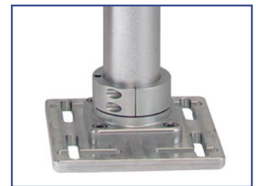
Optional (C-PED-PLT) 5.5" Square base plate with universal slot pattern for easy mounting

Call Today for Quick Delivery 1-800-524-9900 or visit www.havis.com