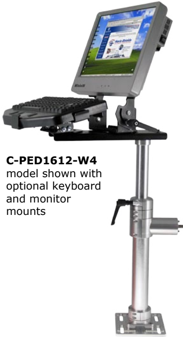
C-PED1612-W4 model shown with optional keyboard and monitor mounts