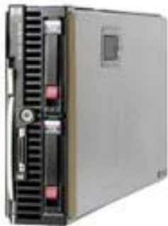
Figure 1-1. HP ProLiant xw460c Blade Workstation

The HP ProLiant xw460c Blade Workstation (Figure 1-1) is a data center workstation that offers data center security, manageability, and remote multi-location access flexibility—all with a workstation-class user experience. With dual-core and quad-core Intel® Xeon™ processors and features similar to desktop workstations, the dual-processor-capable HP ProLiant xw460c combines power-efficient, high-density computing with expanded memory for maximum performance.