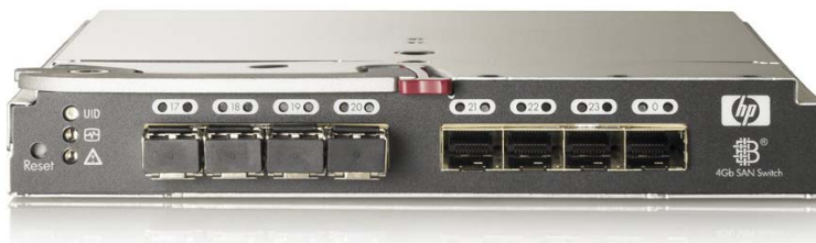
Figure 4-1. Brocade 4GB SAN switch*

* This illustration shows 4 SFPs. However, out-of-the-box the Brocade 4/12 SAN switch has 2 SFPs in the left-most slots.