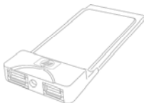
2 Port USB 2.0 Cardbus