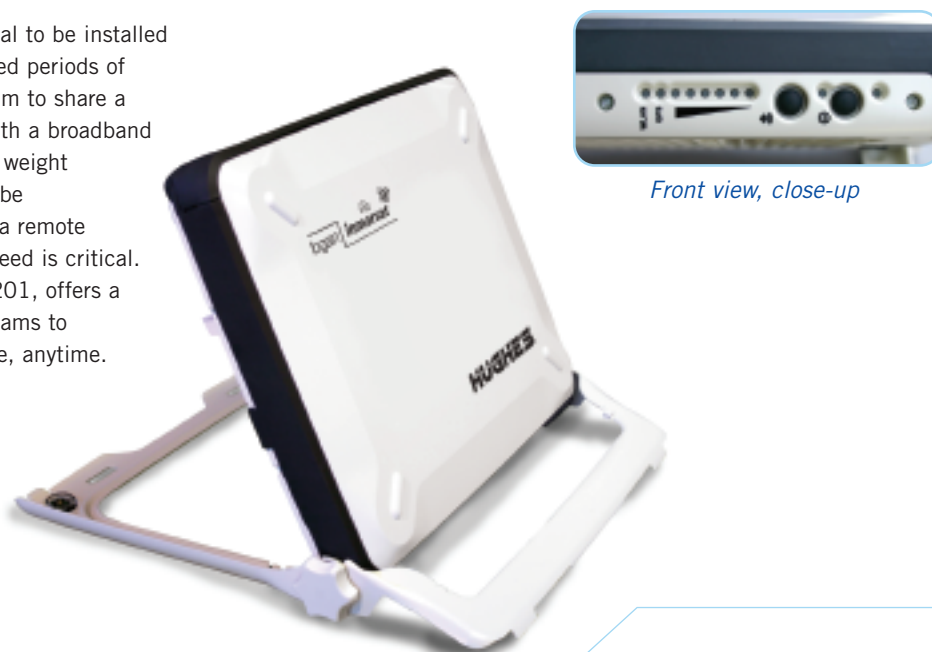
Front view, close-up

The rugged design of the 9201 allows the terminal to be installed outside in extreme weather conditions for extended periods of time. Multiple user support allows your entire team to share a single 9201 simultaneously, providing the site with a broadband local area network. The terminal's small size and weight allows you to easily move it from site to site and be connected again within minutes. When you're at a remote site, sending and receiving the information you need is critical. The Inmarsat BGAN service, together with the 9201, offers a true alternative network that enables corporate teams to communicate their critical information—anywhere, anytime.