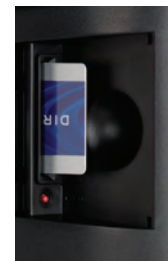
1 - Access Card Slot