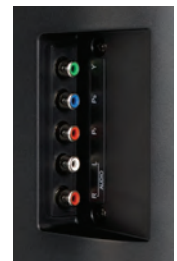
2 - Component Video and Audio Inputs